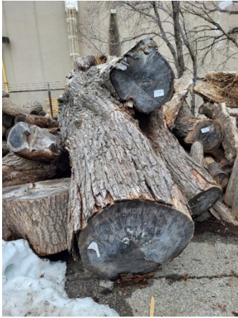
Silver maple trunk