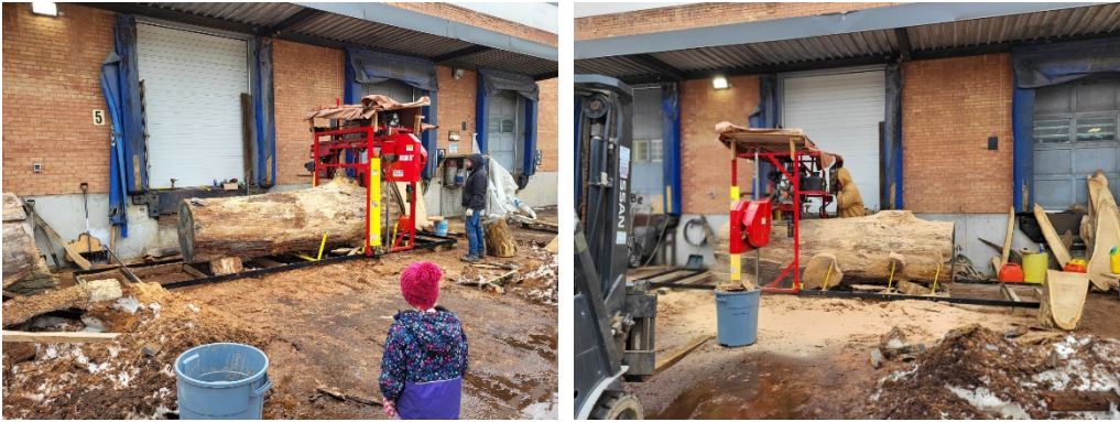
Milling of the Great White Oak