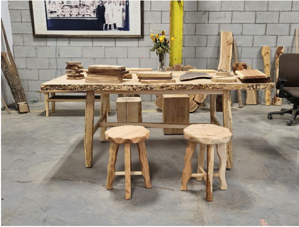
Silver maple table and chairs