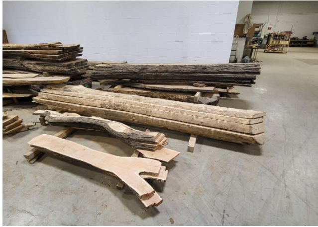
Moss Park honey locust in front, U of T Siberian Elm behind